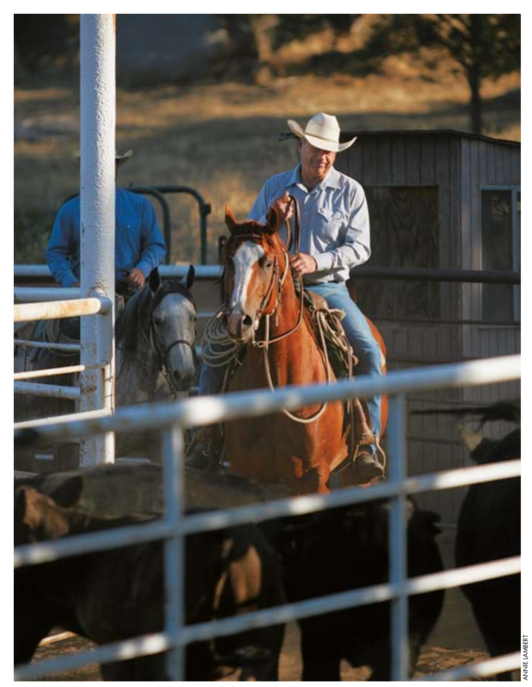
The Singleton Ranches are home to the workers who operate the cattle and performance horse divisions.

Cristobal Ranch has operated for some 400 years.