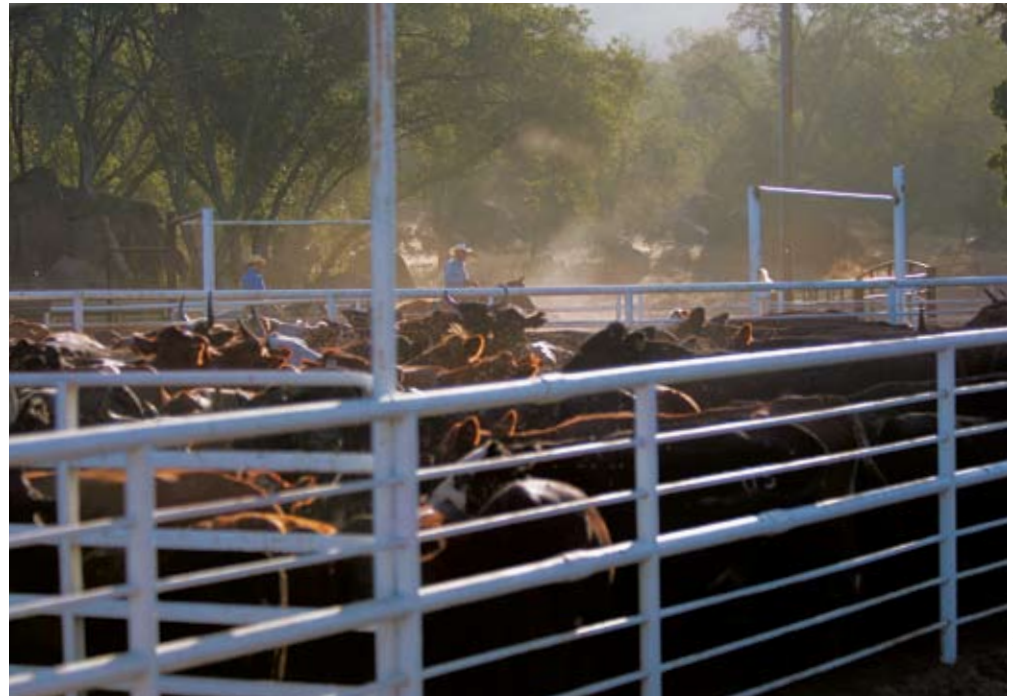
Singleton cowboys settle cattle after a morning gather at River Island Ranch in California.

Working toward goals planned roughly five years in advance, the breeding and performance aspects of the Singleton's horse project are gaining momentum. The plan is a growing, flexible entity designed to add good horses to